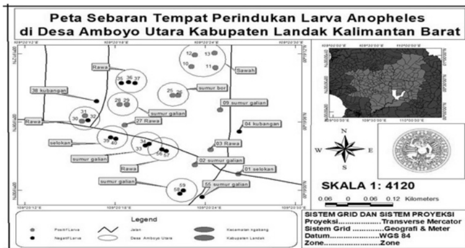
Figure 2. Map of Distribution of Breeding Places in Area with High Malaria Cases in North Amboyo Village, Ngabang Subdistrict, Landak Regency, 2018

mapping of breeding places distribution according to breeding places showed p=0.001 which meant that the clustering was significant. When there were cases of malaria near the cluster, there would be an increase in risk of malaria transmission in that cluster area.